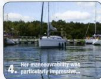
4. Her manoeuvrability was particularly impressive...