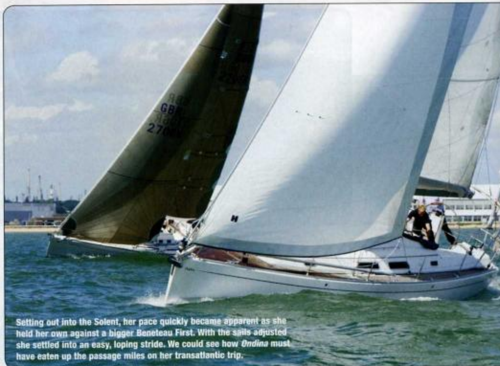
Setting out into the Solent, her pace quickly became apparent as she held her own against a bigger Beneteau First. With the sails adjusted she settled into an easy, loping stride. We could see how Ondina must have eaten up the passage miles on her transatlantic trip.

To contact him about these or any other brokerage boats he has for sale see www.michaelschmidt.co.uk or Tel: 023 8045 5714.