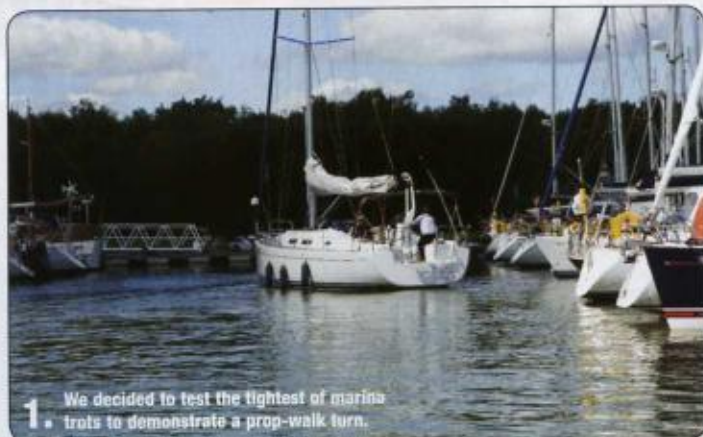
1. We decided to test the tightest of marina trots to demonstrate a prop-walk turn.

He knows his boat and handled her easily. In the turbo mode we tried it would take me a while to get the best from her. In standard mode with self-tacker and the mainsail she was designed for, this boat is a doddle and delivers the kind of fast, easy cruising the builders promise.