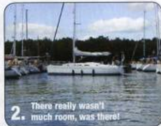
2. There really wasn't much room, was there!

The boat was in remarkable condition both above and below decks after 5,500 miles or so on her own bottom and another 3,000 sitting proudly on top of a ship. She boasts the same creature comforts as Pero et , but has a lighter wood interior that I found particularly pleasing.