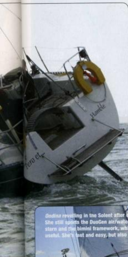
Ondina revelling in the Solent after crossing the Atlantic. She still sports the DuoGen air/water generator on her stern and the bimini framework, which proved extremely useful. She's fast and easy, but also big and comfortable.