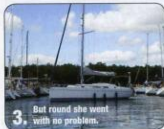
3. But round she went with no problem.