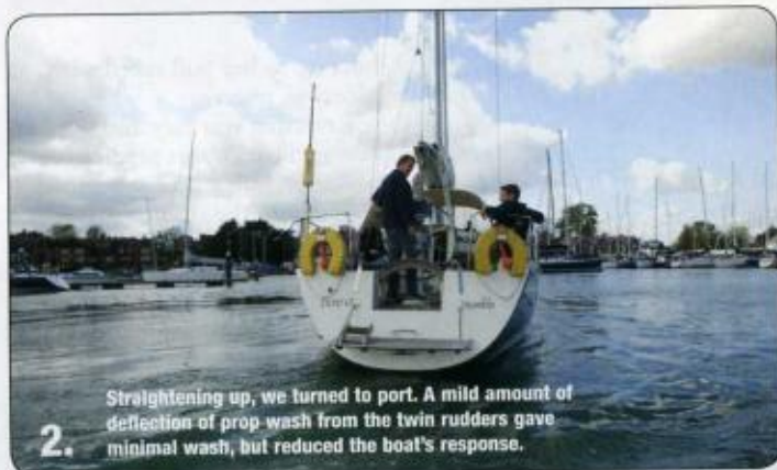
2. Straightening up, we turned to port. A mild amount of deflection of prop wash from the twin rudders gave minimal wash, but reduced the boat's response.