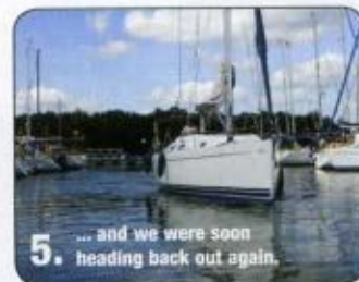
5. ...and we were soon heading back out again.

After my experience on the older boat, I was pleased to see the newer model has a step in the transom as standard – other people had reached the same conclusion as I had.