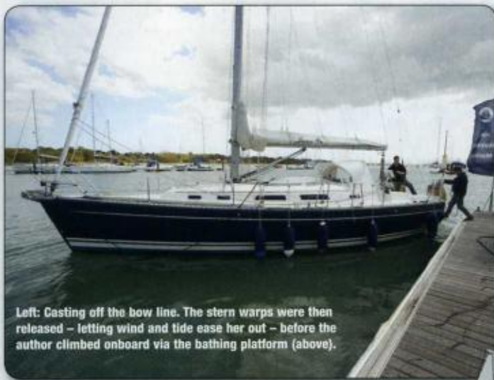
Left: Casting off the bow line. The stern warps were then released – letting wind and tide ease her out – before the author climbed onboard via the bathing platform (above).