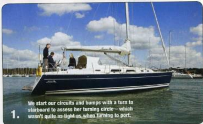
1. We start our circuits and bumps with a turn to starboard to assess her turning circle – which wasn't quite as tight as when turning to port.