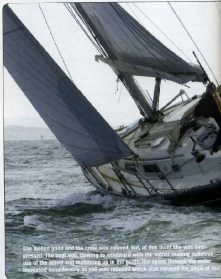
She looked good and the crew was relaxed, but, at this point she was over-pressed. The boat was clawing to windward with the author making judicious use of the wheel and feathering up in the gusts. Her speed through the water increased considerably as sail was reduced which also reduced the angle of heel.

For this particular trip we were light handed but keen to push the boat to the limits and discover the helm's break-out point and measure any loss of grip – if that were the actual