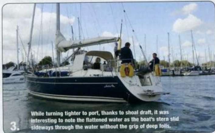
3. While turning tighter to port, thanks to shoal draft, it was interesting to note the flattened water as the boat's stern slid sideways through the water without the grip of deep foils.

can extend the envelope and get the most from her by wriggling up rivers and shallow creeks, generally going where other, deeper draught boats cannot.